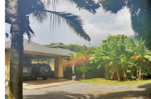
The roof line of the home gives a creative flair to the property - the layout & detail are much more than your basic "box" style home.