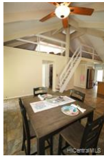
The loft adds a dramatic touch & many options for use of the space.