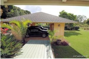
A double-car carport & workshop