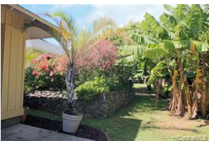
Rock walls enhance the beauty around the property.