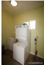
Indoor laundry room has a sink & large closet plus the window for good ventilation.