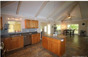
Open concept living space with soaring ceilings.