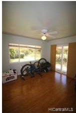
Facing the backyard, this bedroom has a bathroom & lanai & large closet plus the window space outside.