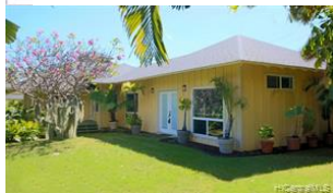
Immaculately-kept property both inside and out!

Click on the arrow to view Additional Photos