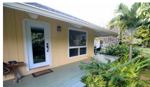
Abundant windows & doors, provide natural light & breeze along with views of the gorgeous tropical grounds.