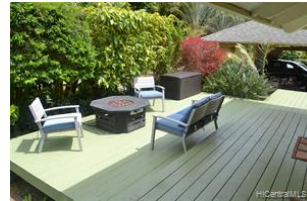
This is one portion of the enormous 689 sq ft of lanai space surrounding this special home.