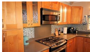
Finest materials, accents, & detail were used.