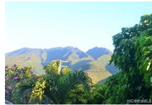
The mountains offer a stunning backdrop.