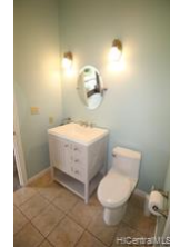
One of two vanities in the master bath.