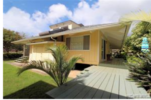
Notice the energy-efficient solar water plus the convenient steps & lanai spaces around the property.