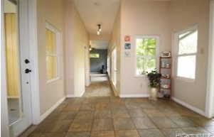
The central foyer area makes a rich statement & connects the wings of the home.