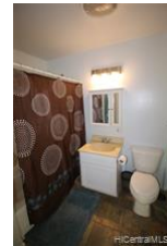
Each bedroom in the home has a bathroom space next to it.