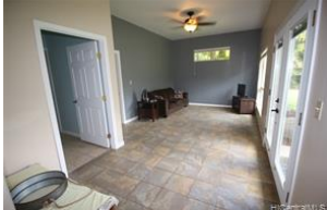
This living space can be used as the master bedroom or media room. The home has a flexible floorplan that offers many options for your perfect living arrangement.