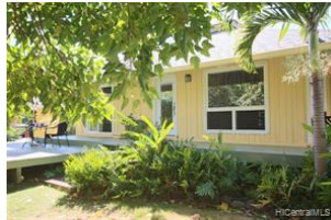
Your tropical home is lovely in every regard.