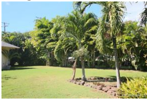
Front lawn area of the property.