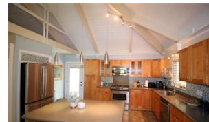
Corian countertops, solid wood cabinetry with glass inserts, glass mosaic backsplash, pendant lighting, stainless appliances - a culinary dream!