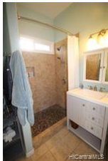
Other vanity & shower in the master bath.