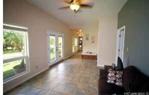
French doors & large windows open to the large yard & garden.