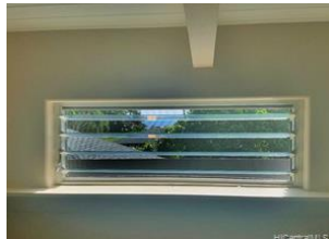
A peek-a-boo ocean view from the loft.