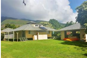
Backyard offers abundant lawn space.